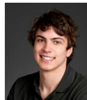
Max Social Media