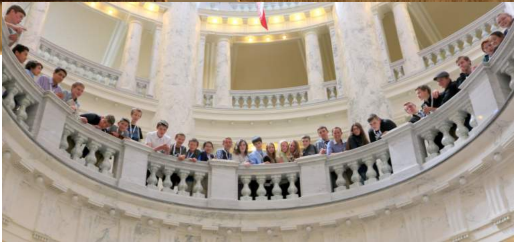
Legislative Branch Tour. Idaho Statehouse Rotunda