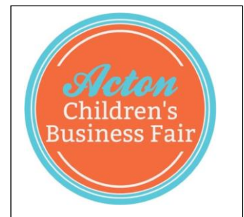
Acton Children's Business Fair